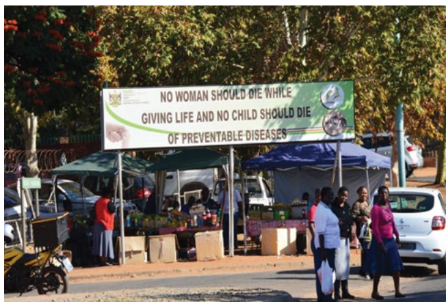
Water yellowed by cassiterite collected for sluicing, DRC, M Craemer 2010

They recommended that each village develop an action group to monitor and engage authorities and to work on community health issues; to engage and meet regularly with health workers to develop joint actions, and to prevent conflict among different groups of services users.