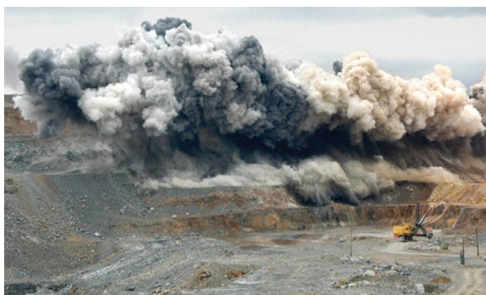
Large plumes of contaminated dust clouds from uranium mining, Nuclear Costs SA, 2016.

This regional picture is summarised in Table 4 below. The green shading indicates what is well provided for in law. Red indicates what is not provided for. Yellow indicates what is partially provided for and orange more poorly provided for.