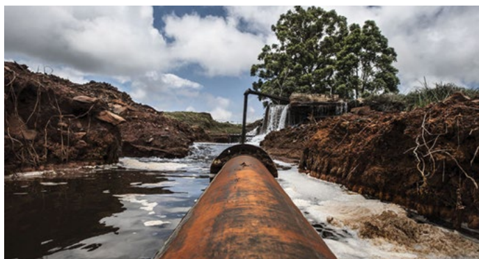
Environmental damage from mines P Botes 2016

The rights and duties in relation to health and mining can be found in our laws and regulations. Some countries in our region have already begun to use international standards to review their own laws. South Africa, through the King Committee Report on Corporate Governance 2009 , aims to bring local companies in line with global best practices. Kenya in the Nairobi Process: A Pact for Responsible Business aims to apply the UN Guiding Principles on Business and Human Rights , in the emerging oil and gas sector.