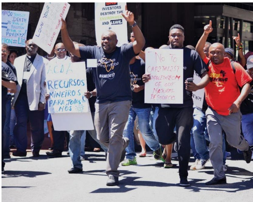
CSOs at the 2017 Alternative Mining Indaba

in EI operations. Trade unions have promoted labour rights in large and small mines. Environmental lobbies have engaged on land reclamation and pollution. Civil society has campaigned on the rights of mining and resettled communities, including to free prior informed consent and participation in decisions affecting them. Communities supported by civil society have taken companies to court when they do not implement their legal duties.