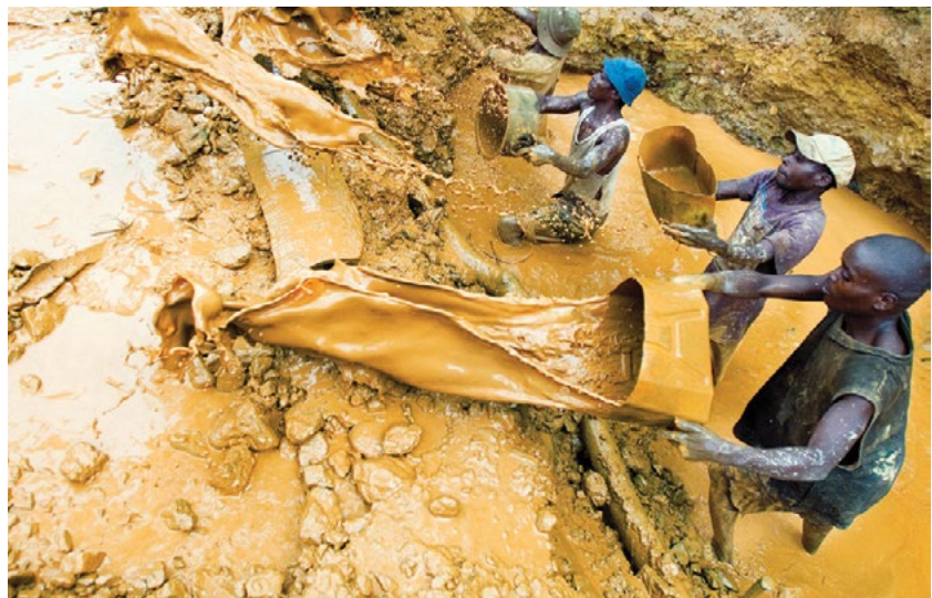
Water yellowed by cassiterite collected for sluicing, DRC, M Craemer 2010