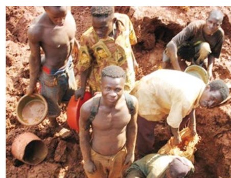
Small scale mining, Zimbabwe.