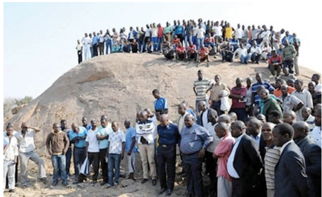
Lonmin gold miners negotiations Govt of South Africa flickr stream

These barriers may be significant. However, communities, civil society and social institutions have played an important role in producing better health and social protections in our region.