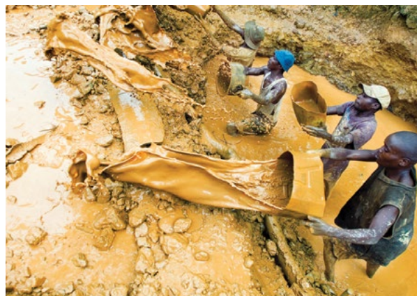
Water yellowed by cassiterite collected for sluicing, DRC, M Craemer 2010

However, they also bring health risks of injury and illness for workers and surrounding communities.