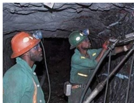
Nhaka Underground mine Zambia, Mwansa C Mining and public health in Zambia, 2018

It is not only the workers who are affected. As we discuss later, if the noise, chemicals, dust or gasses contaminate the areas where people are living or working around the mines, they too may be affected.