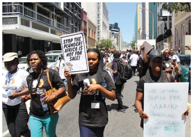
March at the 2018 Alternative Mining Indaba

Regionally the Southern African Trade Union Co-ordinating Council can also draw attention to and negotiate health standards in the tripartite meetings of the SADC employment and Labour Sector.