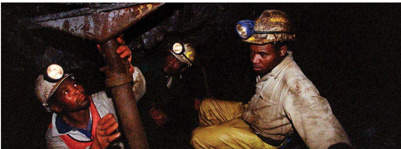
South Africa underground mines fire taps

Small scale mines may not be covered even by existing laws, or may face challenges in implementing these laws. This too is further discussed in the next section.