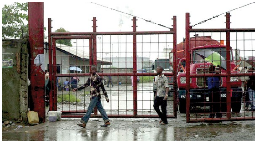
Port Harcourt Refining Ltd in Alesa-Eleme, Liberia.

For those leaving mines or post mine closure there needs to be better record keeping of who lives and works in these areas and their health literacy on effects, rights and duties