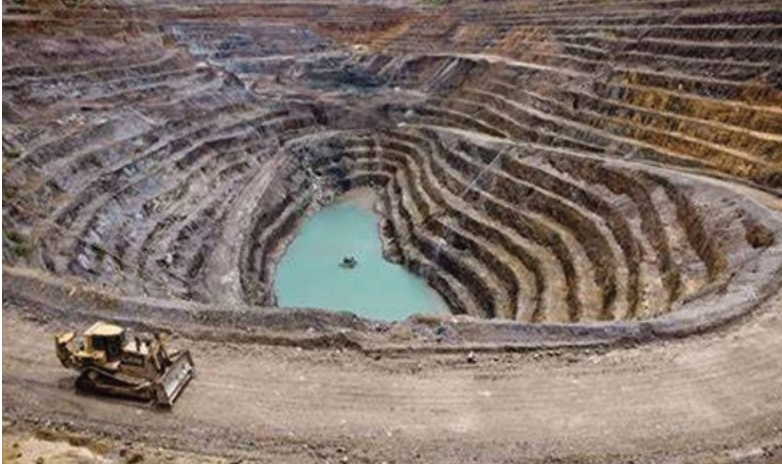
Nchanga open pit mine Zambia, Mwansa C Mining and public health in Zambia, 2018

Open pit mining and stripping removes soil and vegetation from the surface to access the minerals. When explosives are used they may spread chemicals and dust, including into the atmosphere, rivers and other water sources. The waste from mining activities may contain metals and chemicals that can contaminate surface and underground water. Water collecting in pools in open pit mines can be sites of mosquito breeding, increasing the risk of malaria.