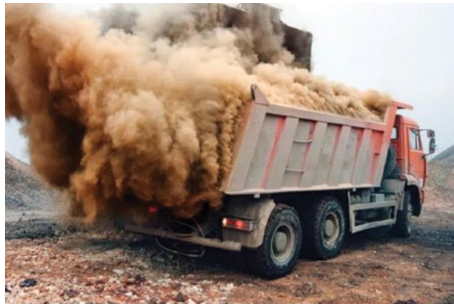
Communities that live near mines are exposed to dust from these mines

The mining industry has in the past, implemented various strategies to reduce pollution from mine dumps. This has included spraying mine dumps with water and planting grass on dumps to catch the dust. These strategies can, however, be ineffective when the grass withers during the dry season and when sprayed water is absorbed or evaporates. It has thus been suggested that there be buffer zones between mining dumps and where people live.